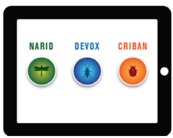
Fig-3- Leading Malnets Exclusively Targeting Mobile Devices

The growth in requests to malnets from mobile devices was driven by eight unique malnets in 2012. Three of the malnets, Narid, Devox and Criban, targeted mobile devices exclusively while the others simply expanded their malicious activities to include mobile devices. Narid and Devox are no longer active malnets. Criban continues to show a low level of activity with 83 new hosts over the past year. The maximum number of hosts used in a given day was 3.